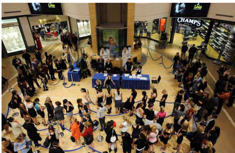
Brentwood Town Centre is on the block for $100 million in a sale to Vancouver-based Shape Properties and a large Ontario-based pension fund, according to the commercial broker Avison Young Commercial Real Estate.