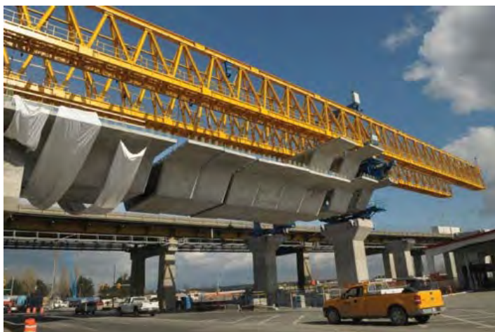
Completion of the Port Mann/Highway 1 project could make the United Boulevard industrial area more attractive to commercial tenants.

CRAIG HODGE/THE TRI-CITY NEWS Buy The Tri-City News Photos Online