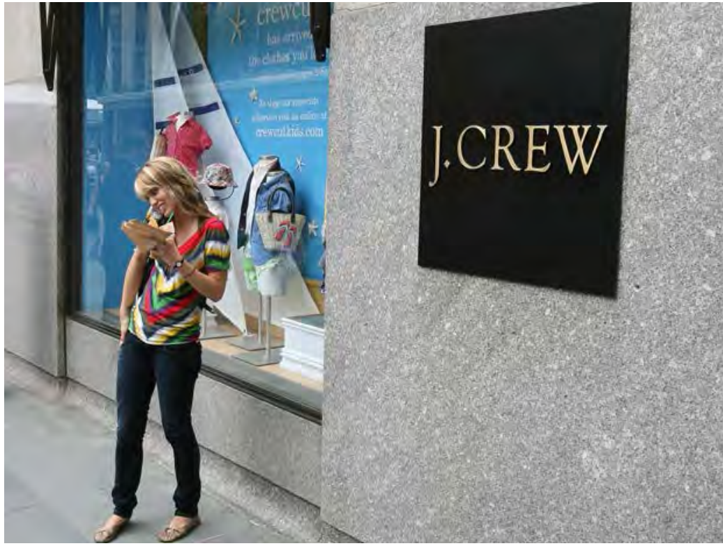
J. Crew store in Rockefeller Plaza.