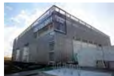
Gallery: Take a sneak peak inside Calgary's new Telus Spark