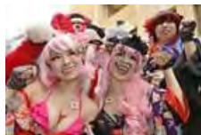
Gallery: Scary 'n' sexy for Halloween