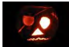
Reader photos: Are you proud of your pumpkin? Share a photo!