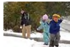
Gallery: Halloween snowstorm

Home News Opinion Business Sports Entertainment Life Health Technology Travel Jobs Cars Homes