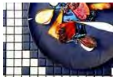
Gallery: Top 10 best new restaurants in Canada (Calgary not on list)