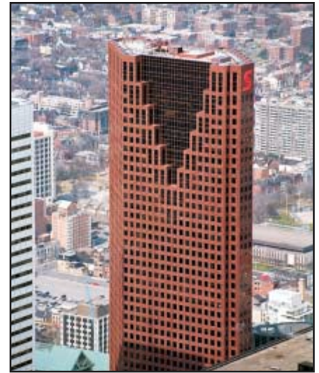
Scotia Plaza 40 King Street West, Toronto