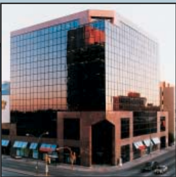
Sask Energy Place 1777 Victoria Avenue, Regina

131 Provencher Boulevard - 40,265 sq.ft. office retail 290 Vaughan Street - 33,000 sq.ft. office 1655 - 67 Inkster Boulevard - 22,562 sq.ft. industrial 1100 Fife Street - 9,888 sq.ft. office