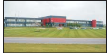
2599 Speakman Drive, Mississauga Avison Young Investment Opportunity

Suite 740, 30 Eglinton Avenue West Mississauga, ON L5R 3E7 T: (905) 712-2100 F: (905) 712-2937 E-mail: gm.mississauga@ay-on.com