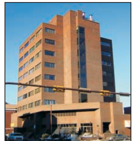
Parkside Place 602 - 12th Avenue S.W., Calgary

Parkside Place - $8,400,000 Lands within the City of Airdrie - $7,900,000 Ricky Bob Racelands - $4,500,000