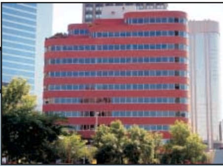
Century Park Place 855 – 8th Avenue S.W., Calgary