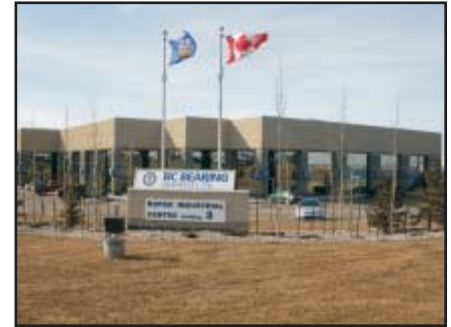
Roper Industrial Centre 59 Street & Roper Road, Edmonton