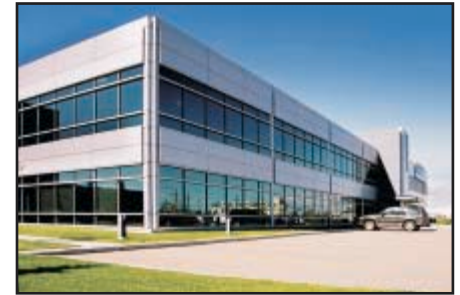
RuffNeck Heaters Building 2827 Sunridge Blvd. N.E., Calgary

Hanover Place, Suite 900, 101 - 6th Avenue S.W. Calgary, AB T2P 3P4 T: (403) 262-3082 F: (403) 262-3325 E-mail: gm.calgary@ay-ab.com