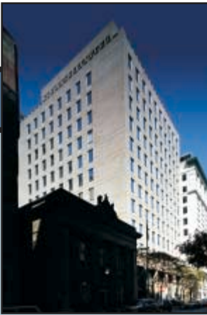
20 Toronto Street, Toronto 155,400 sq.ft. office building sold by Avison Young

Adelaide Place, 150 York Street, Suite 900 Toronto, ON M5H 3S5 T: (416) 955-0000 F: (416) 955-0724 E-mail: gm.toronto@ay-on.com