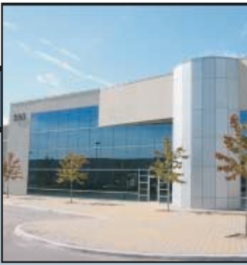
550 Petrolia Road, Toronto New home of Estee Lauder Cosmetics