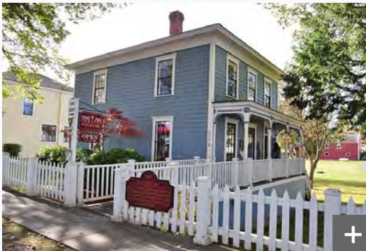
House Hunters: What America's Most Lovably Ridiculous Reality Show Gets Right And Wrong