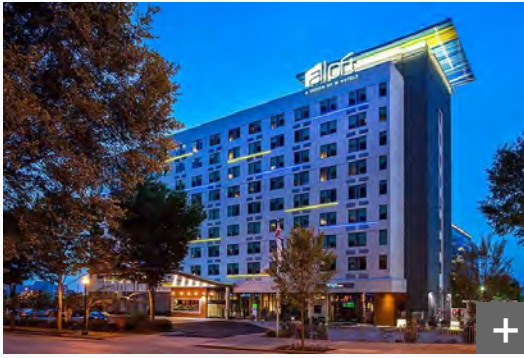
Condor Hospitality Picking Up Downtown's Aloft