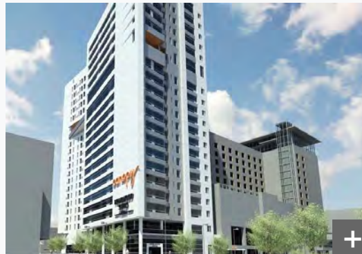
Legacy 'Tapping The Brakes' On Downtown Canopy Hotel