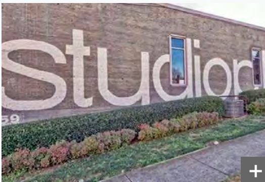
O4W Boutique Hotel Seeking Green Light