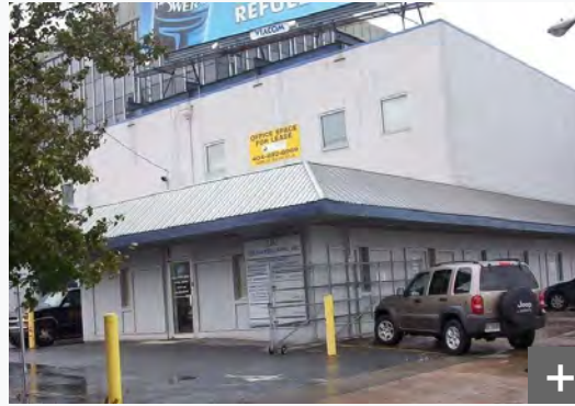
Student Housing Tower, Dual Hotel Among Permits Filed