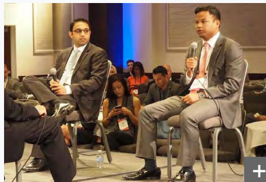
Hotel Owners Waiting To Sell May Have Missed The Boat